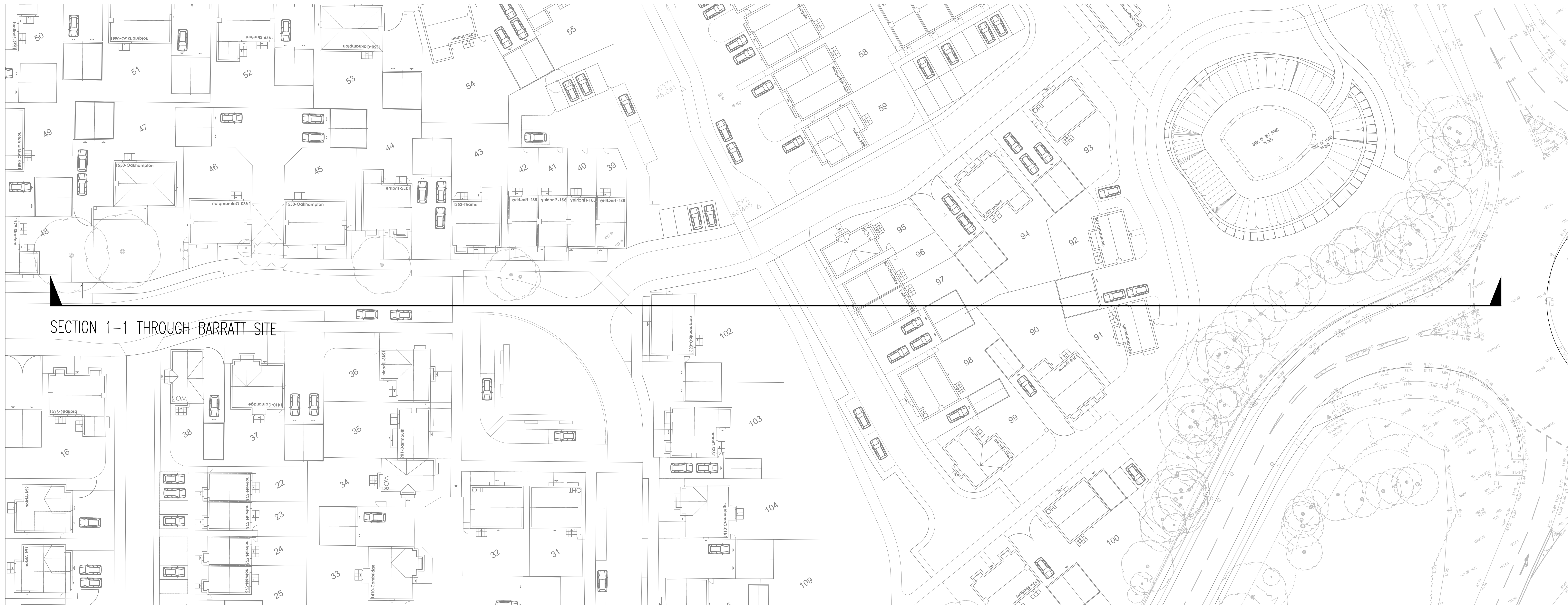
SECTION 1-1 THROUGH BARRATT SITE